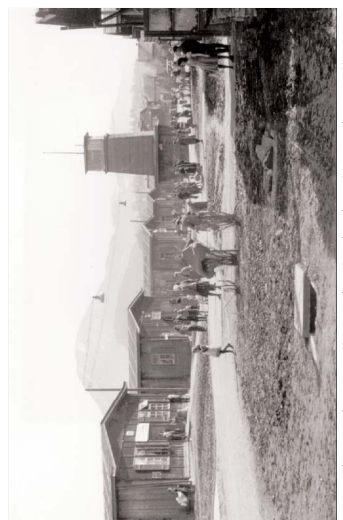
The center of a DP camp.