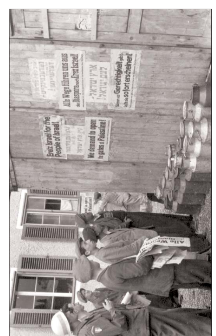
Political posters in a DP camp, most likely Feldafing (Courtesy of YIVO Institute for Jewish Research, New York).