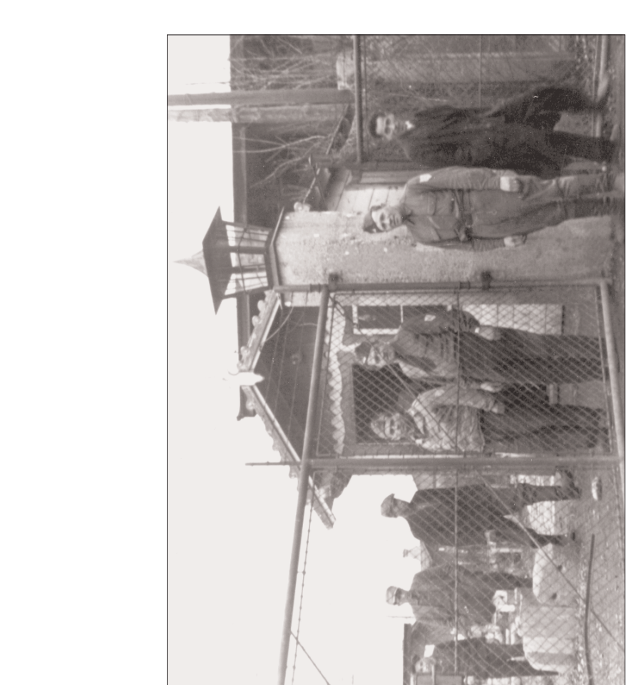
Jewish residents and police at the gate of a DP camp, most likely Feldafing